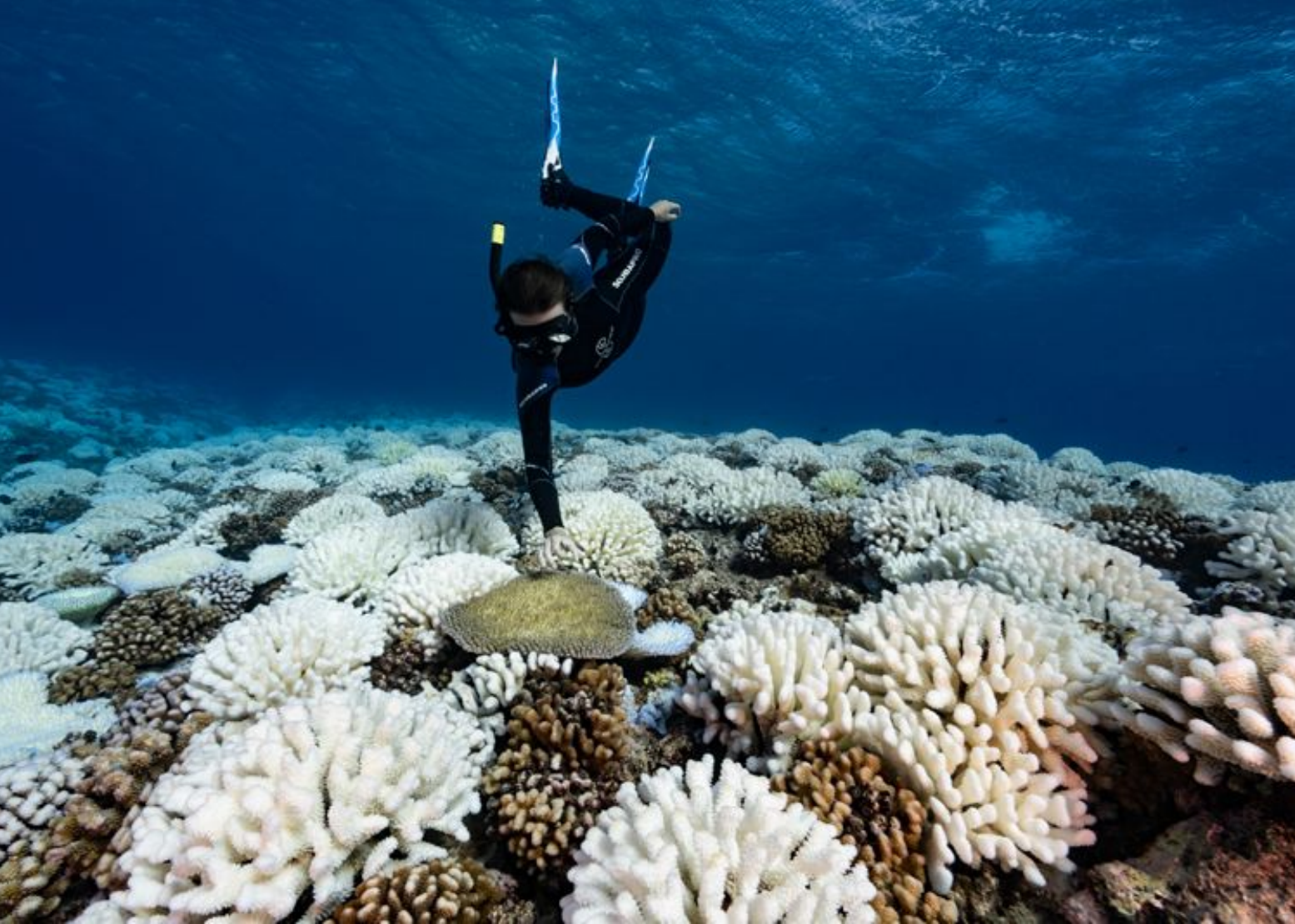
Bleached corals on a reef near the island of Moorea in French Polynesia in the South Pacific.